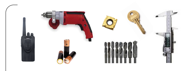
SmartDrawer is ideal for managing consumable and returnable materials

Cutting Tools • Abrasives • Adhesives • Sealants Security Items • Calibrated Instruments and Tools Personal Protective Equipment (PPE) • Fasteners Welding Supplies • Maintenance Supplies (MRO) Safety Equipment and Supplies • And many more!