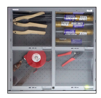
Lights indicate access; location buttons make it simple to select products