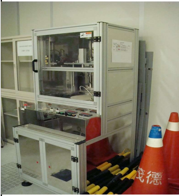
Main Body (Back)