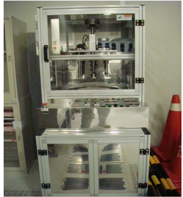
Main Body (Side)